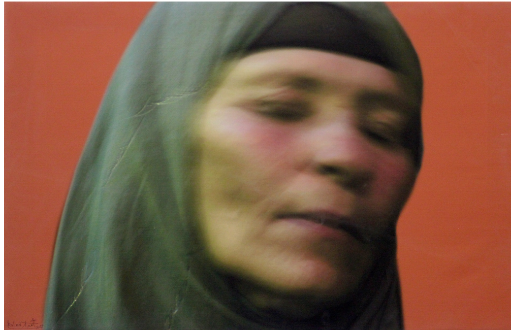
Top Left: Moulid (Blue) by Ahmed Khaled - Photography & computer graphics print on Canvas (2012) 50x80 cm